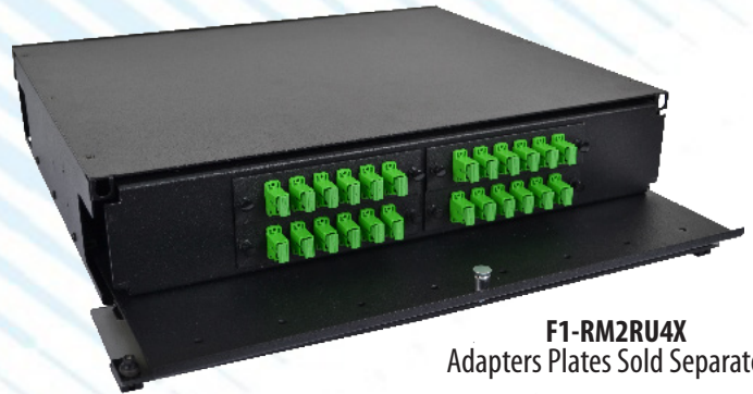
F1-RM2RU4X Adapters Plates Sold Separately