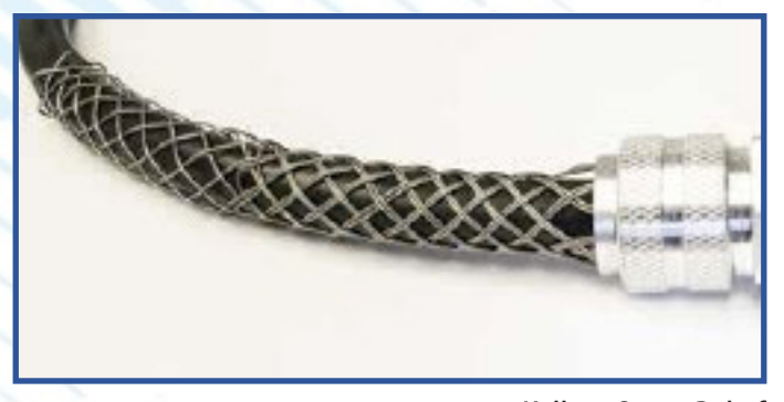
Kellum Strain Relief