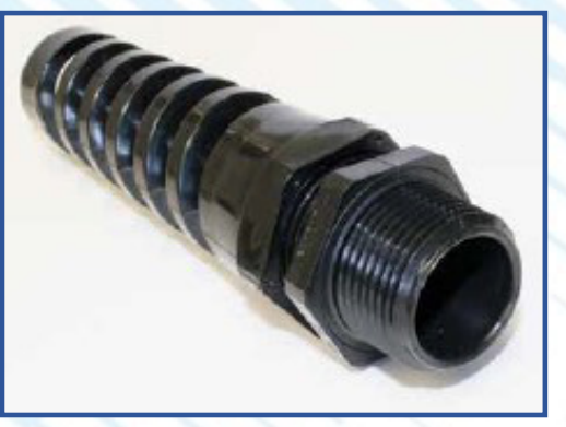
Flexible Pigtail Strain Relief