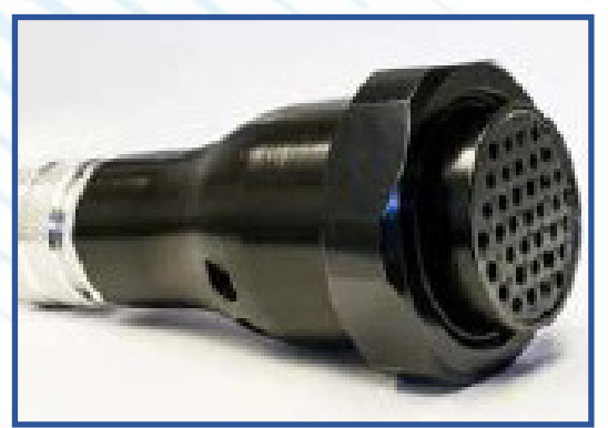
Female, In-Line Cable Mount Plug