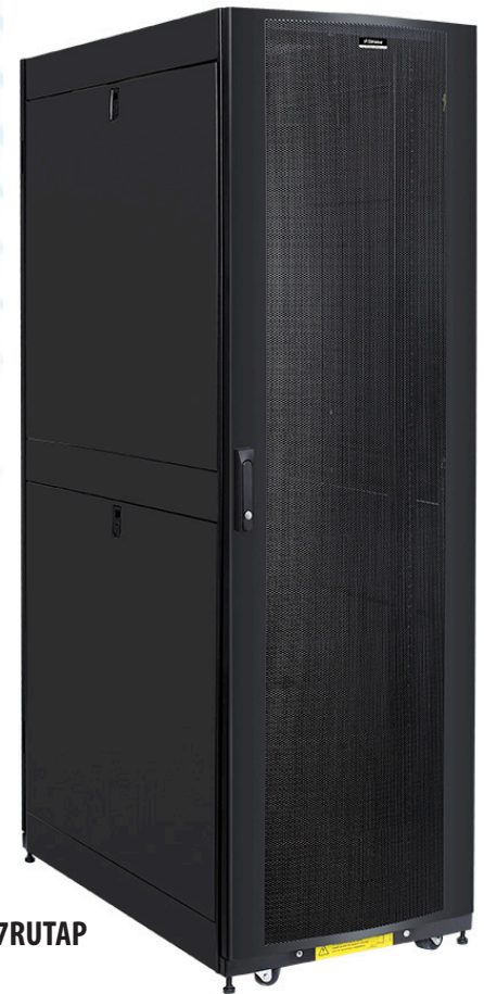
Part #: F1SR47RUTAP